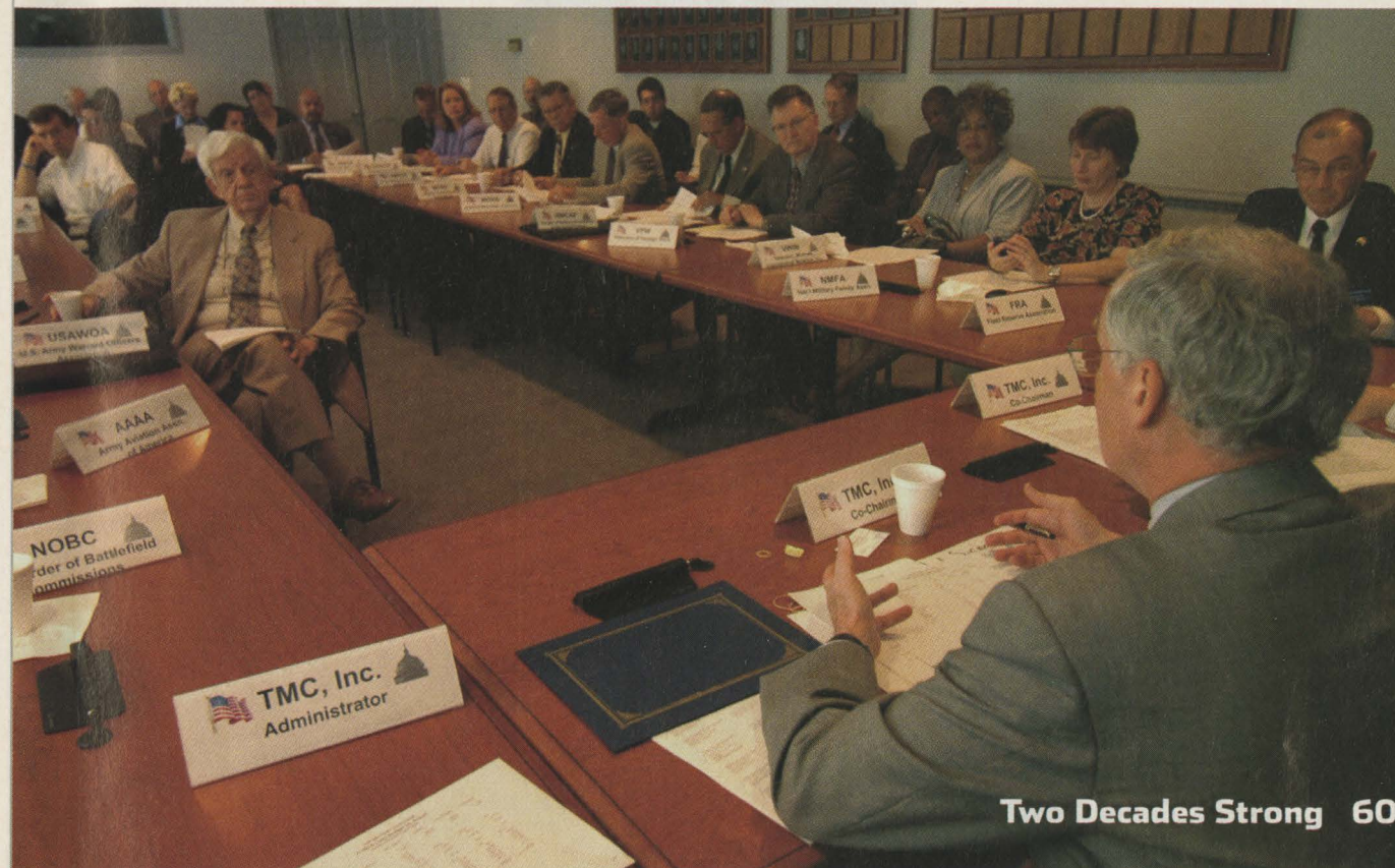
Two Decades Strong 60