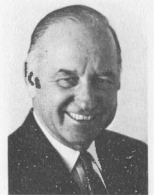
MELDRIM THOMSON, JR.

MELDRIM THOMSON, JR., born in Pittsburgh, Pennsylvania, May 8, 1912. Attended Mercer University; LL.B., University of Georgia. Married; four sons, two daughters. Publisher. Public offices include: School Board Chairman; Member, Constitutional Convention; Governor of New Hampshire since January, 1973. Vice Chairman, New England Governors' Conference, 1974. Congregationalist. Republican.