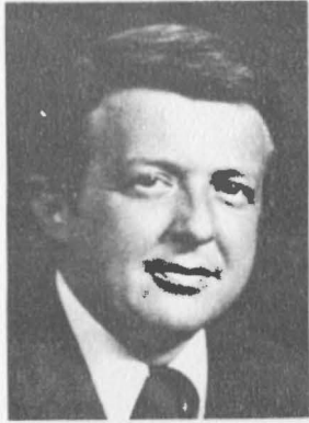
JAMES E. HOLSHOUSER, JR.