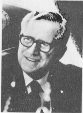
OTIS R. BOWEN