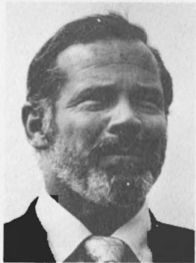
JAY S. HAMMOND