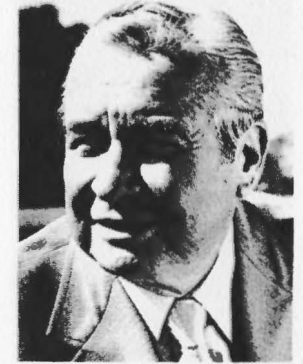
JAMES A. RHODES

Inaugurated January, 1963 Re-elected November, 1966 Term expired January, 1971 Inaugurated January, 1975 Term will expire January, 1979