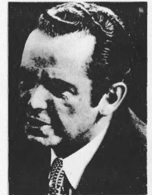
WILLIAM G. MILLIKEN

Succeeded to office January, 1969 Elected November, 1970, 1974 Term will expire January, 1979