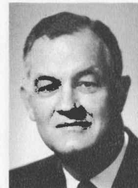
MILLS E. GODWIN, JR.

Inaugurated January, 1966 Term expired January, 1970 Inaugurated January, 1974 Term will expire January, 1978