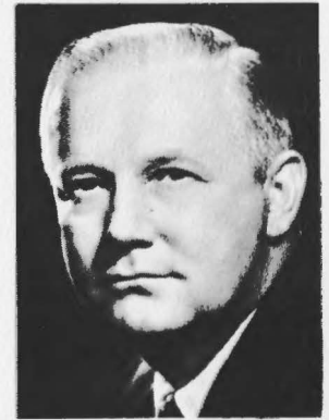
ARCH A. MOORE, JR.

ARCH A. MOORE, JR., born in Moundsville, West Virginia, April 16, 1923. B.A. in Political Science (1948) and LL.B. (1951), West Virginia University; also attended Lafayette College. Married; one son, two daughters. Attorney. World War II veteran; Recipient of Purple Heart; Combat Infantryman's Badge; European Campaign Ribbon with three Battle Stars. Public offices include: Member, West Virginia House of Delegates, 1953-56; Member, United States House of Representatives, 1957-68 (served as Ranking Republican Member of numerous House Committees); Governor of West Virginia since January, 1969. Member of American Bar Association, American Judicature Association and Phi Delta Phi Legal Fraternity. Member of many fraternal, commercial, public service and veterans' organizations. Member, National Governors' Conference Executive Committee, 1969-70. Chairman, National Governors' Conference, 1971-72. Methodist. Republican.