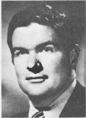
CHRISTOPHER S. BOND