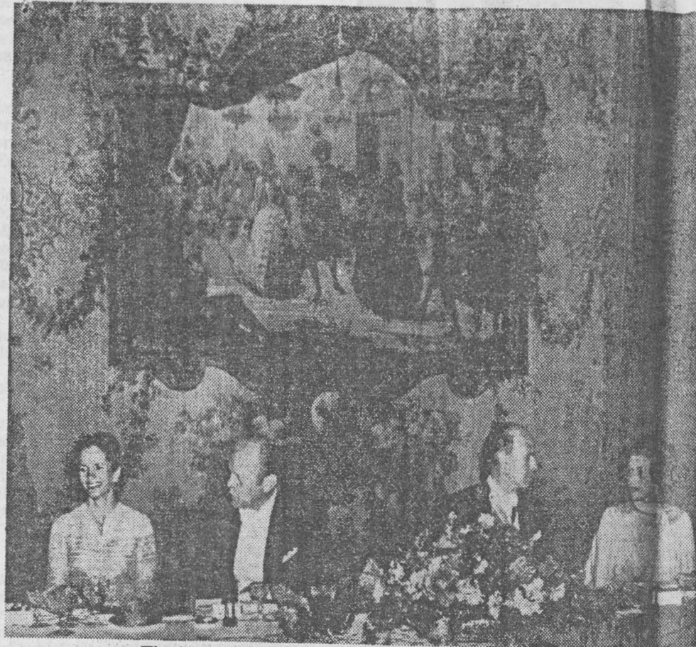
The head table, backed by a Beauvais tapestry.