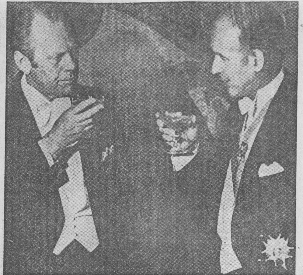
The presidents exchange toasts.