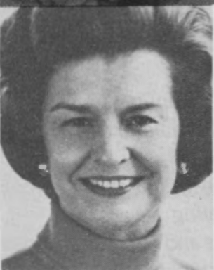
Betty Ford plans parties ahead, tries new dishes on her own family first.

Digging deep into the White House store of treasures, Mrs. Gerald Ford has brought to light historic china not used for years. "I have a great time playing around with all the china, crystal, and silver collections we have here," she says. "I never realized I would be as fascinated by the White House as I am. My favorite china is the Rutherford Hayes, 1879, with a different animal on each plate . . . it always causes comment when I bring it out. We've only one set, the Johnson china, which can serve 120 people, the usual number for a state dinner. So we sometimes arrange separate tables with different china. I like to do the unexpected. Why should everything always be matching? I have even planned one setting for a table with eight differ-