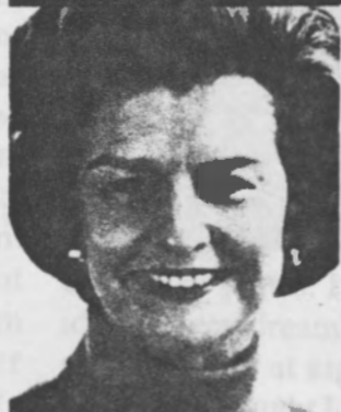
Betty Ford plans parties ahead, tries new dishes on her own family first.