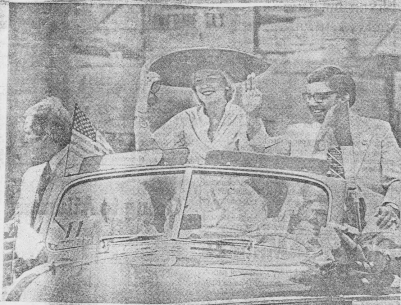
CELEBRATION — Susan Ford rides through East Los Angeles as part of the 42nd annual Mexican Independence Day parade.