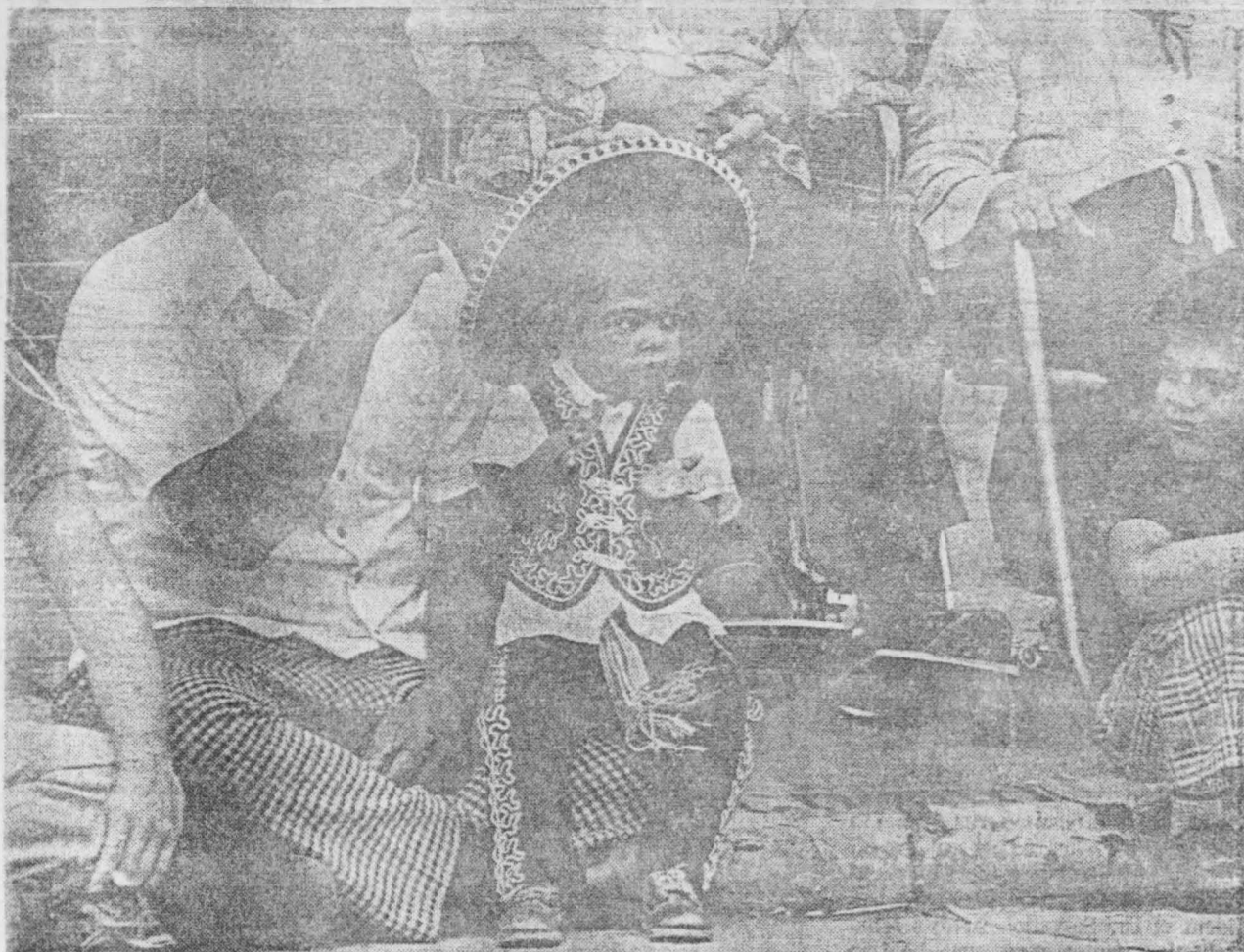
pendence Day parade. At right, young spectator applauds as President Ford's daughter goes by.