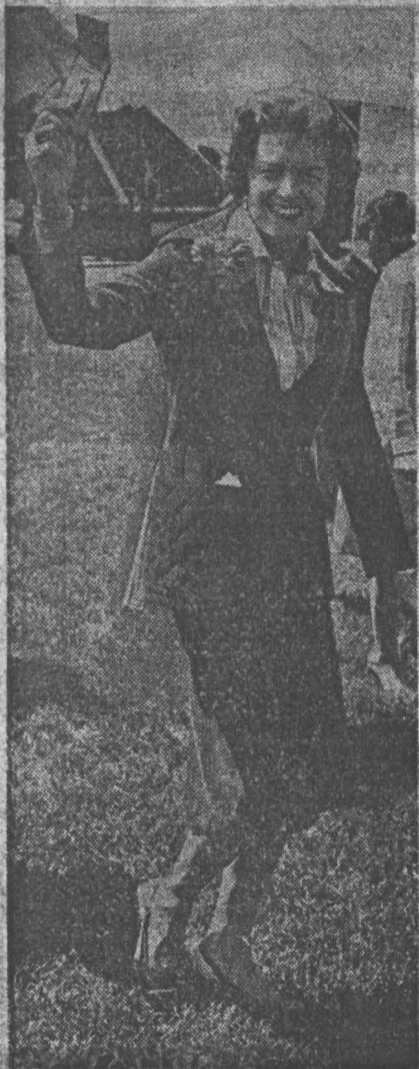
First Lady Betty Ford.

tional Park Service plan to save tourists foot-wearying hours of standing in line for White House tours.