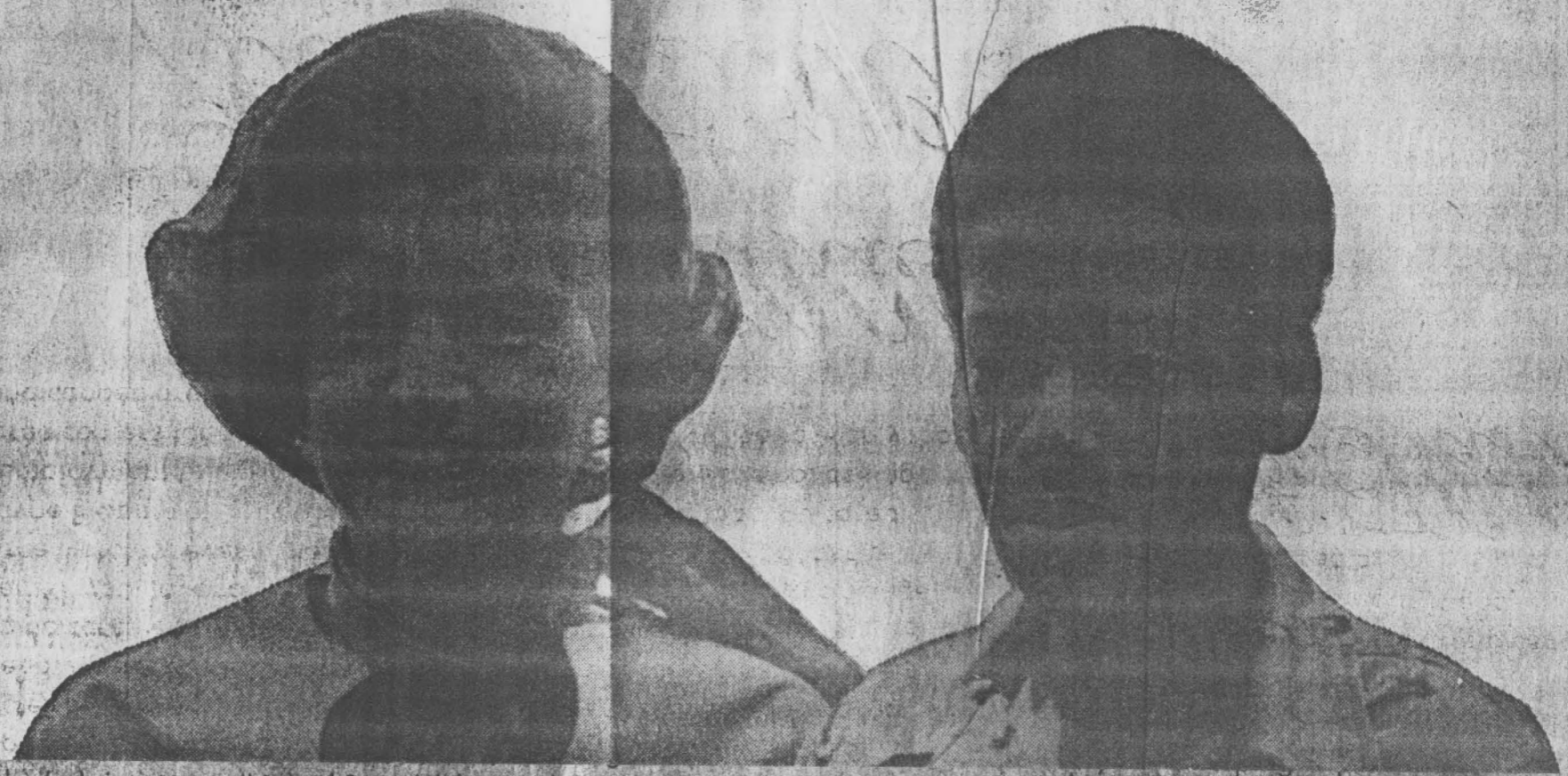
little miracles by helping