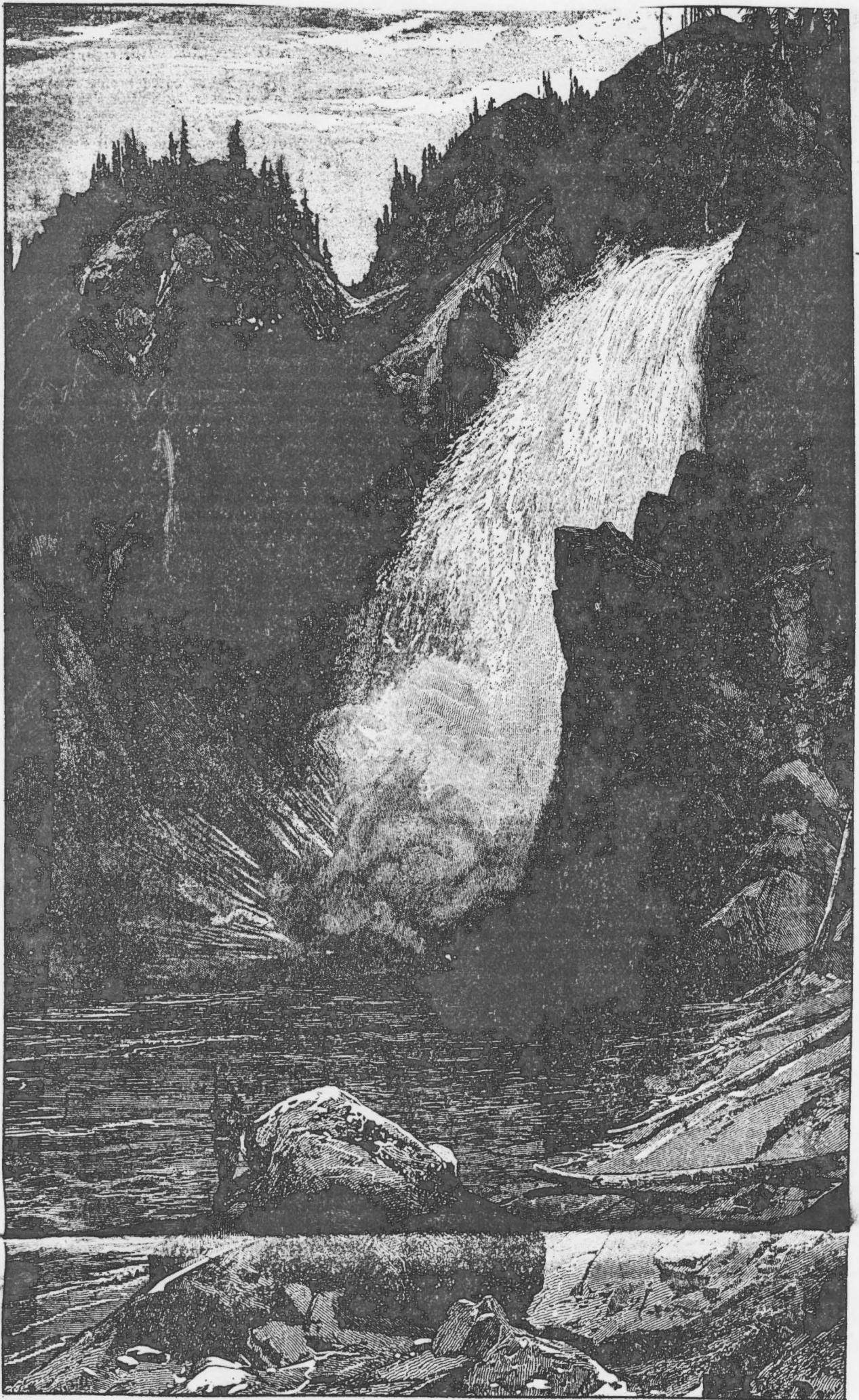
The Upper Yellowstone Falls, by Thomas Moran