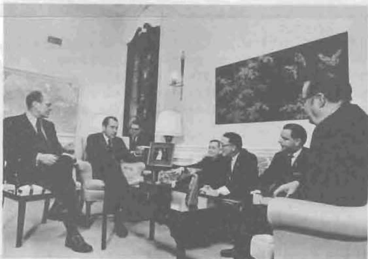
BIPARTISAN WHITE HOUSE MEETING -- President Nixon periodically calls both Democratic and Republican congressional leaders to the White House to brief them on some subject. Here, I am seated at the President's right as he points toward Sen. Robert P. Griffin of Michigan, Senate GOP whip, in voicing a view. Seated with Griffin are, left, House Speaker Carl Albert and Senate Democratic Whip Robert Byrd. Senate GOP Leader Hugh Scott is at far right.

The bill is known as the National Health Insurance Partnership Act. It would require all employers--exclusive of the government and religious organizations--to provide all of their workers with health insurance on a cost-sharing basis.