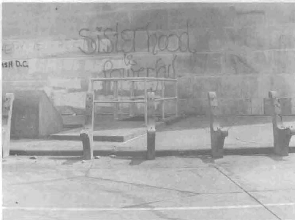
YOU PAY FOR IT -- Vandalism in Washington, like these benches ripped up for fire wood, was just a very small part of the estimated $3 million bill which resulted from the "May Day Tribe's" attempt to shut down the government in early May. The transporting of troops cost $431,000 alone. Metropolitan Washington police and U.S. Park Police put in hundreds of hours of overtime. The Nation's capital was hard-hit economically, with hotels estimating their losses at $250,000 and retail businesses reporting a 50 per cent drop in trade during disruption week.

The number of American troops in South Vietnam has dropped to 259,300, the lowest level in five years. At the present rate of troop withdrawals we will be down to 55,000 by Sept. 1, 1972, or sooner.