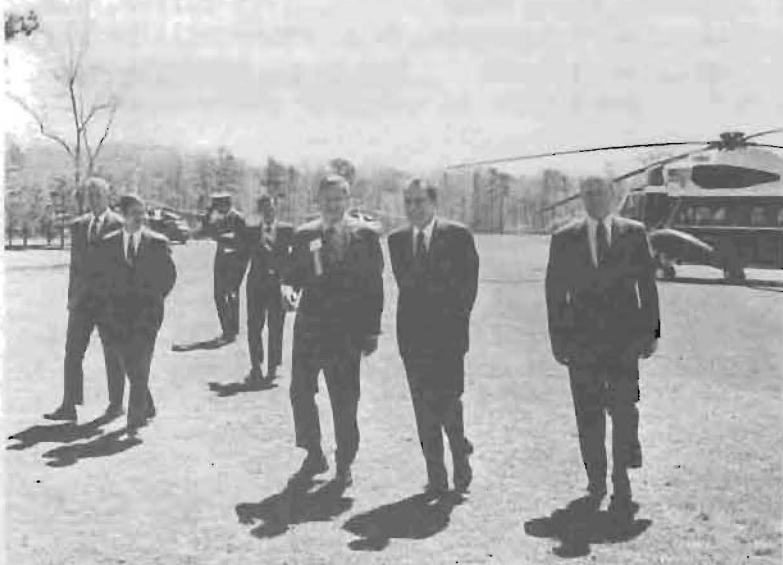
PRESIDENTIAL PARTY -- I was a guest on the Presidential helicopter when President Nixon and I attended the recent Republican Governors Conference in Williamsburg, Va.

We can look for unemployment to go down as the economy continues to expand and more jobs become available.