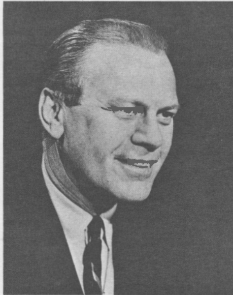
HON. GERALD FORD U. S. Representative of Michigan