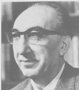
Dr. Michael DeBakey Medical Statesman