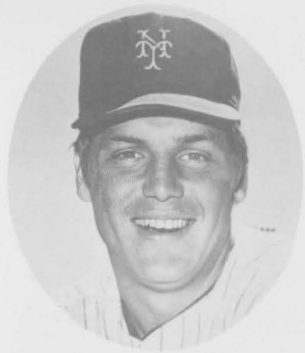
Tom Seaver Sports