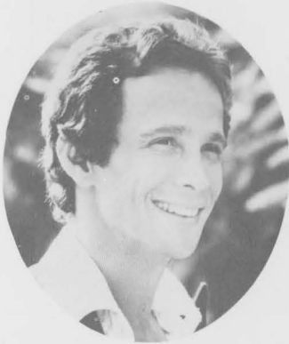
Joel Grey Performing Arts