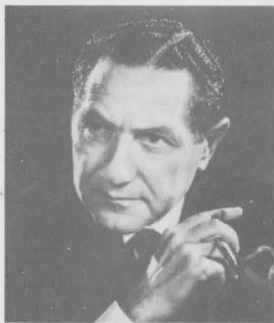
Louis Nizer Literary