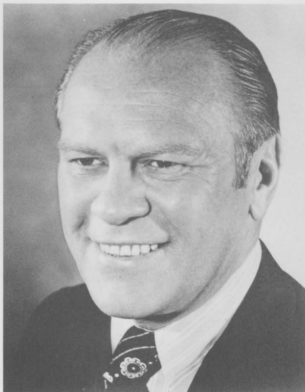
VICE PRESIDENT GERALD R. FORD 1974 National Father of the Year

Wednesday, May 22, 1974 Hotel Americana, New York