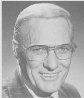
Frank McGee Communications