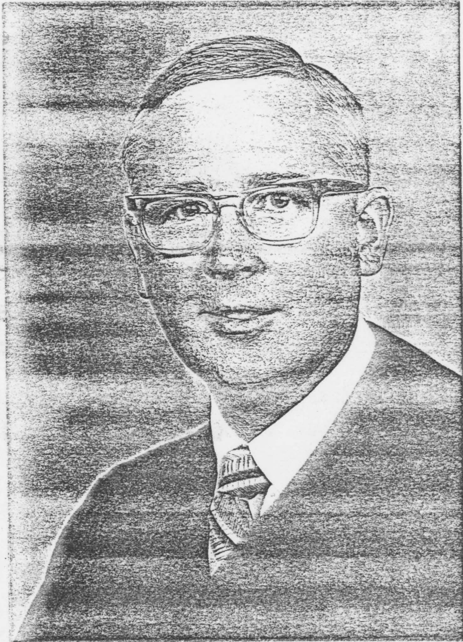
JACK A. KING

JUDGE, SUPERIOR COURT NO. 2 OF TIPPECANOE COUNTY