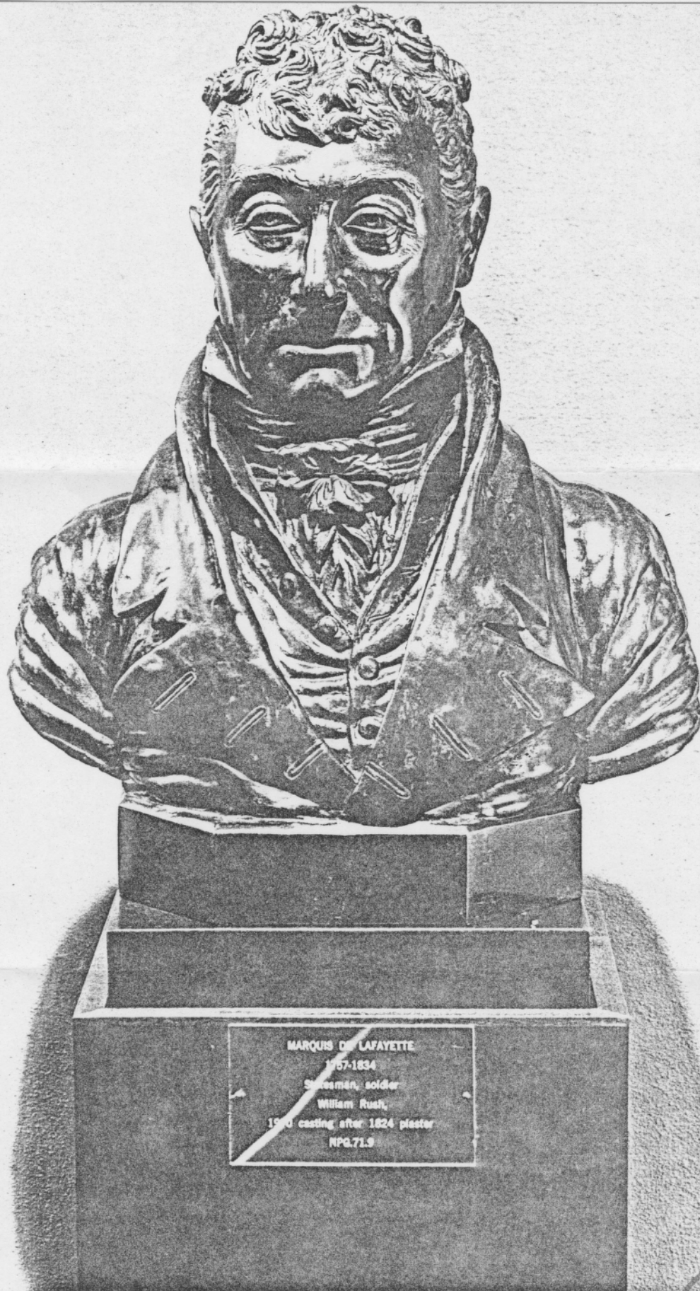
MARQUIS DE LAFAYETTE 1757-1834 Seaman, soldier William Rush, 1870 casting after 1824 plaster NPG.71.9