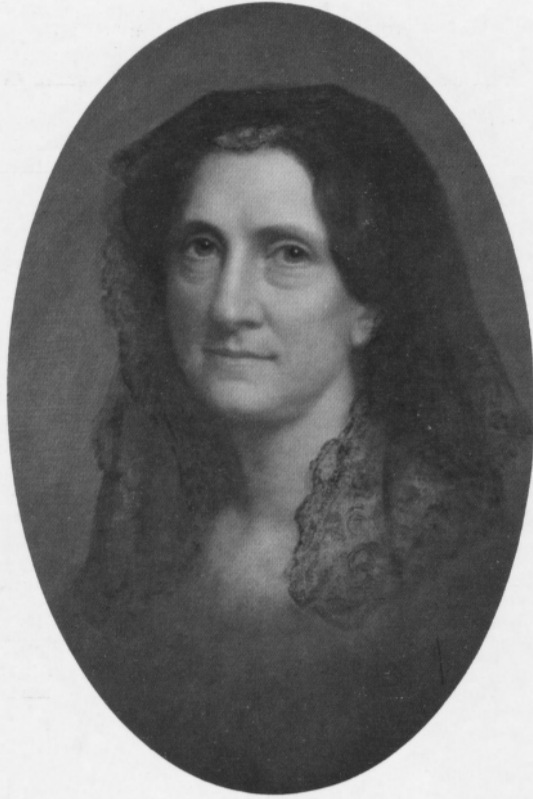
Ann Pamela Cunningham