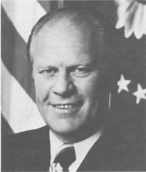
HONORABLE GERALD R. FORD President of the United States