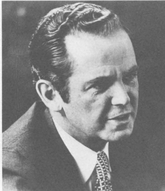
HONORABLE WILLIAM G. MILLIKEN Governor