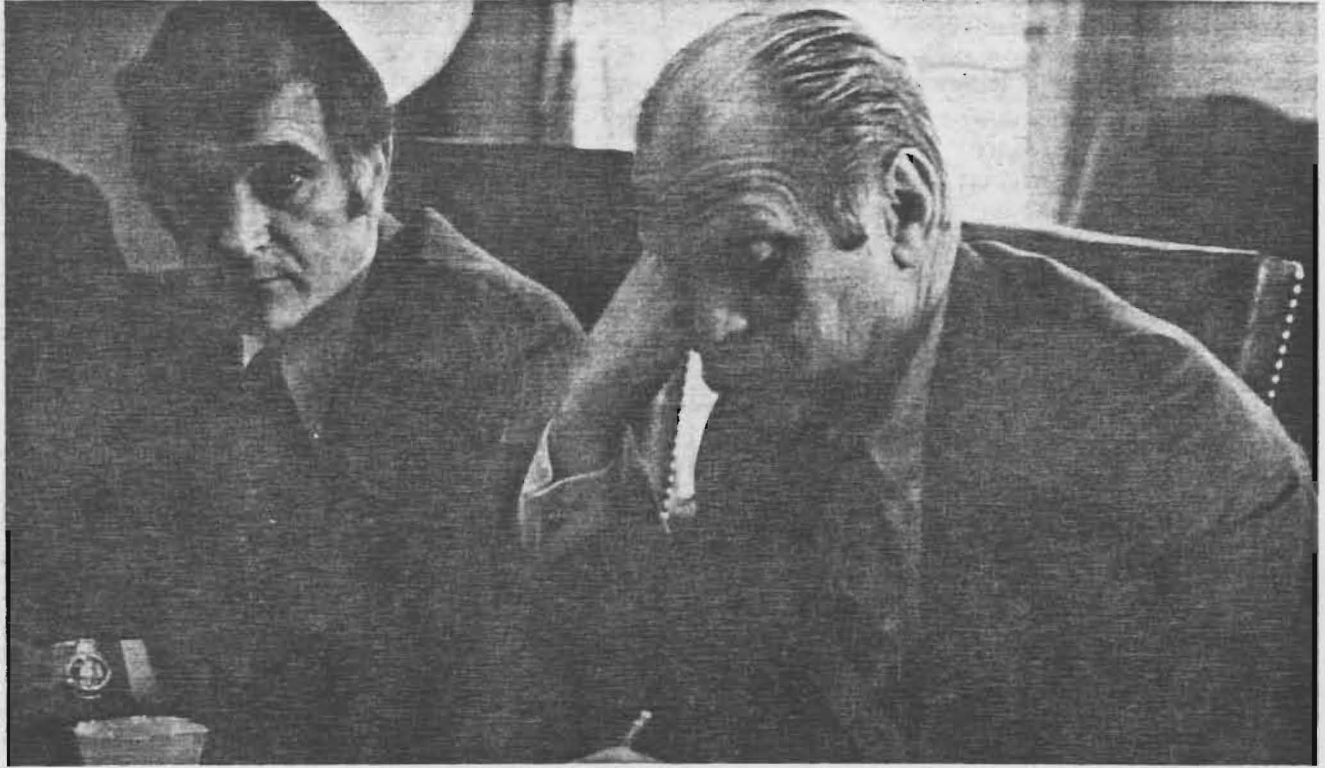
The author with his boss, December 1974.

that price regulation has been a friend to the consumer— any consumer.