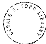
Clarke Reed CR:mg