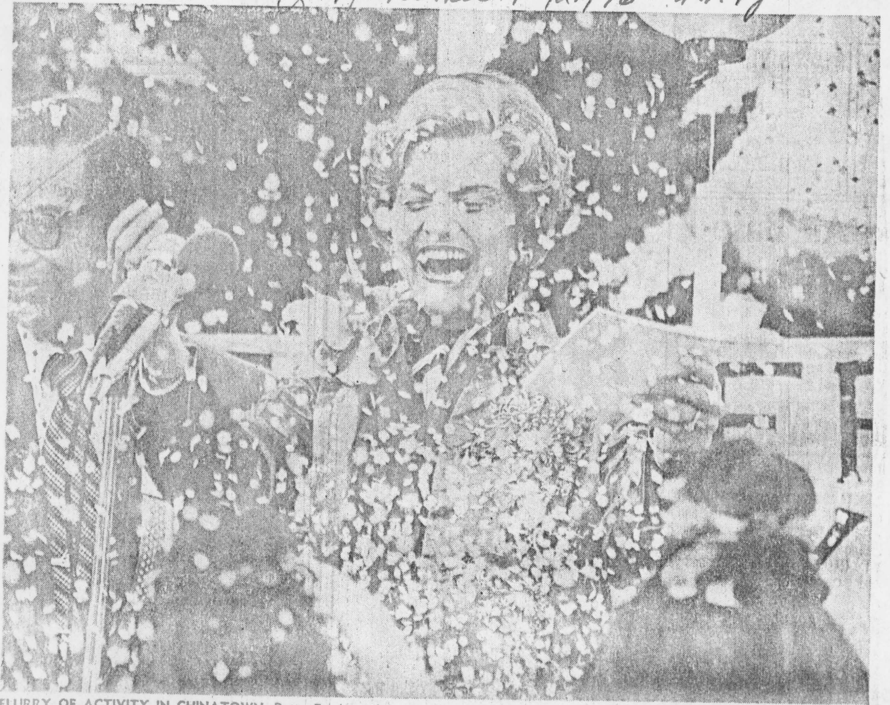
FLURRY OF ACTIVITY IN CHINATOWN—Betty Ford as she was showered with confetti after making campaign stop for President.