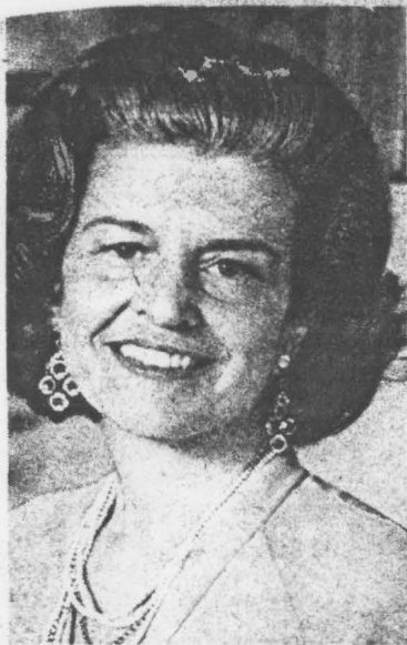
MRS. BETTY FORD —'Silver Spirit Of Life'